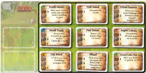
City Block Example

Cloister Chamber ( Trout, C652; Building cost: 4 wood, 2 fish, 2 gold; 4-7 VP )