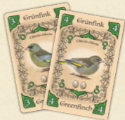
Not a pair